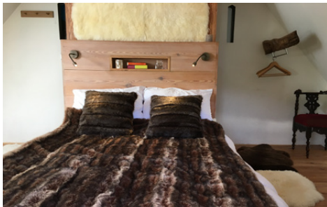
Owl Nest ▶