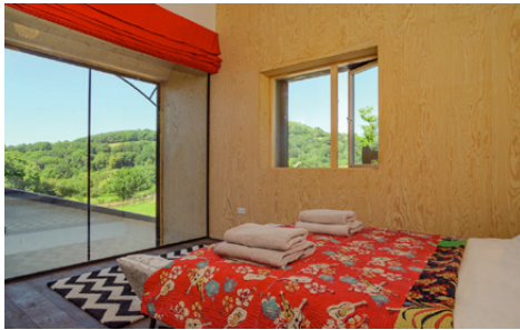
Twin Peaks ▶