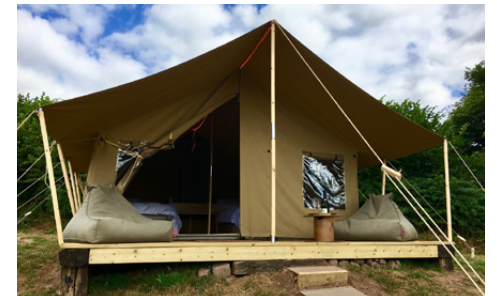
Luxury Safari Tent ▶