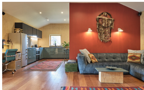
Fforest Cabin ▶