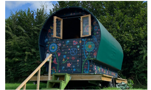
Peace & Love Gypsy Caravan ▶