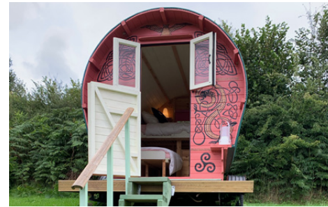
Celtic Dragon Gypsy Caravan ▶