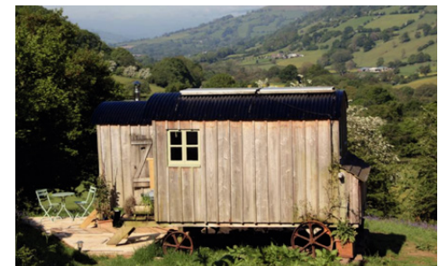
Shepherd Hut ▶