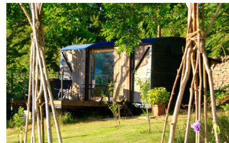
Railway Carriage ▶