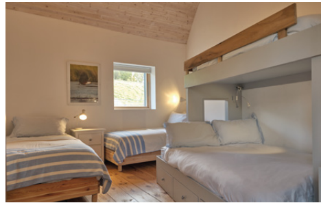
Bunk House ▶